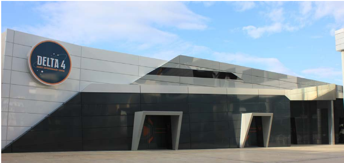
Two exterior shots of Delta 4, Malta's premier family entertainment centre on Level 4 at the Bay Street Tourist Complex, in St George's Bay