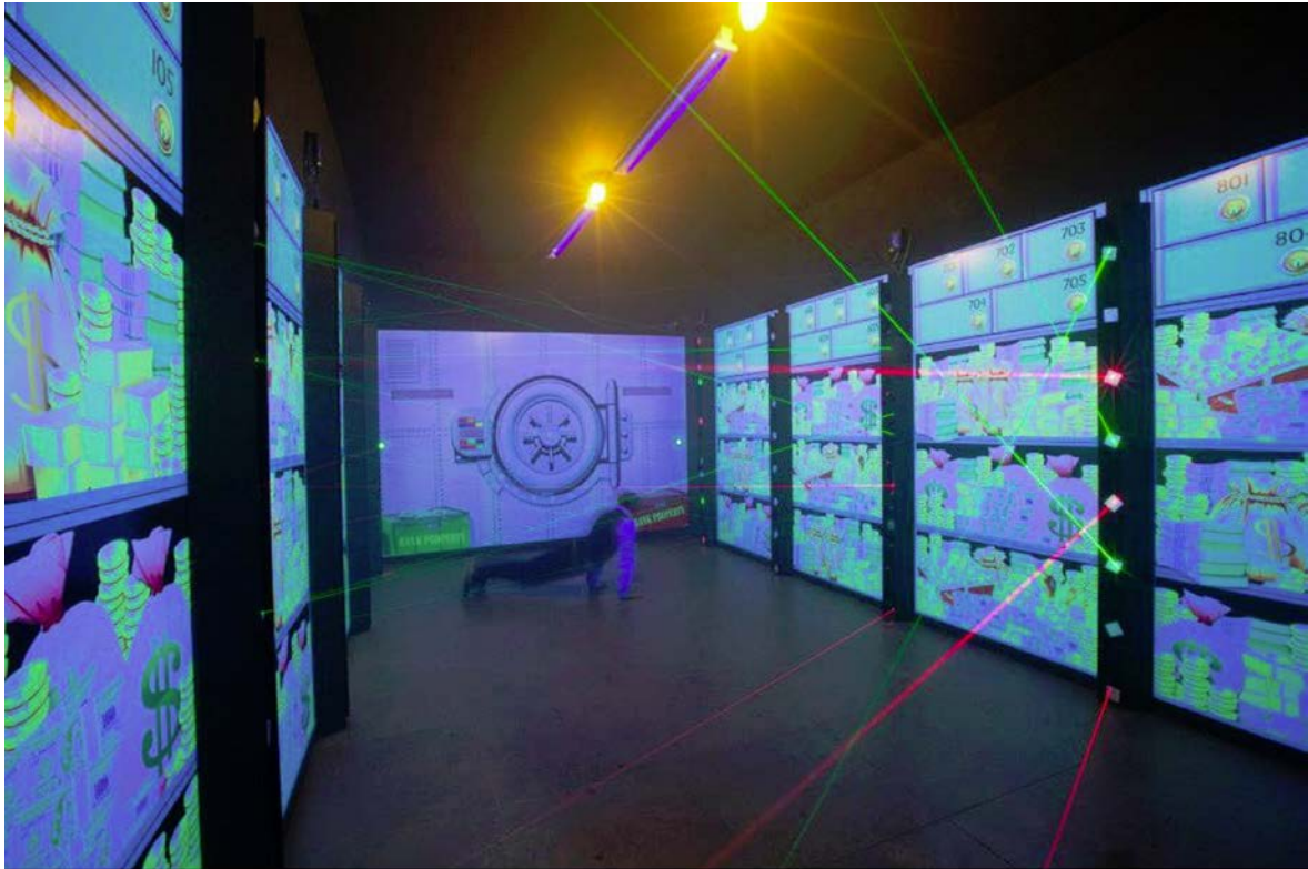
The Laser Labyrinth experience, Entrapment