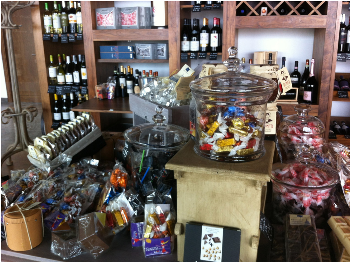
A selection of the Giraudi display at the new Talbot & Bons outlet at Skyparks at Malta International Airport