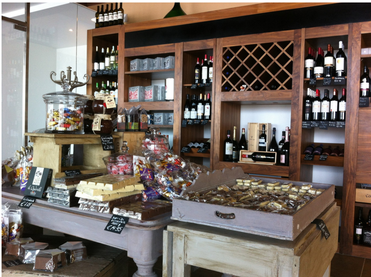
A selection of the Giraudi display at the new Talbot & Bons outlet at Skyparks at Malta International Airport