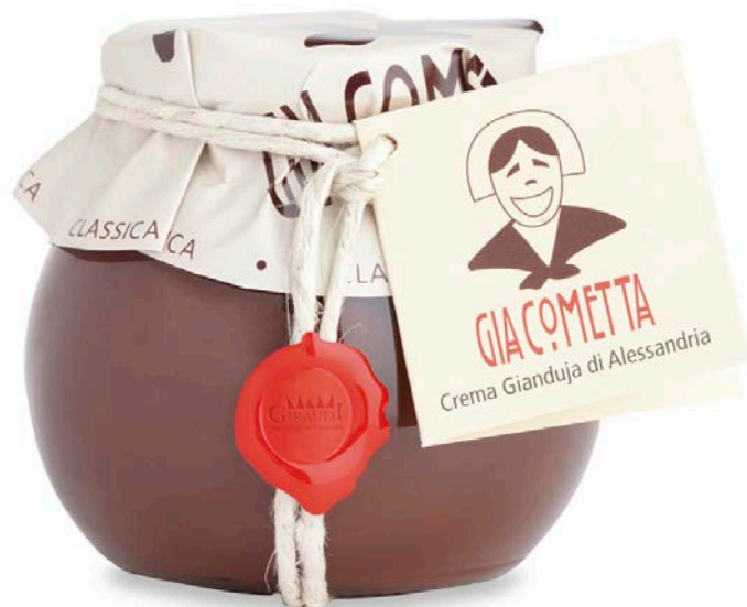
Giacometta, the classic gianduja cream from Alessandria