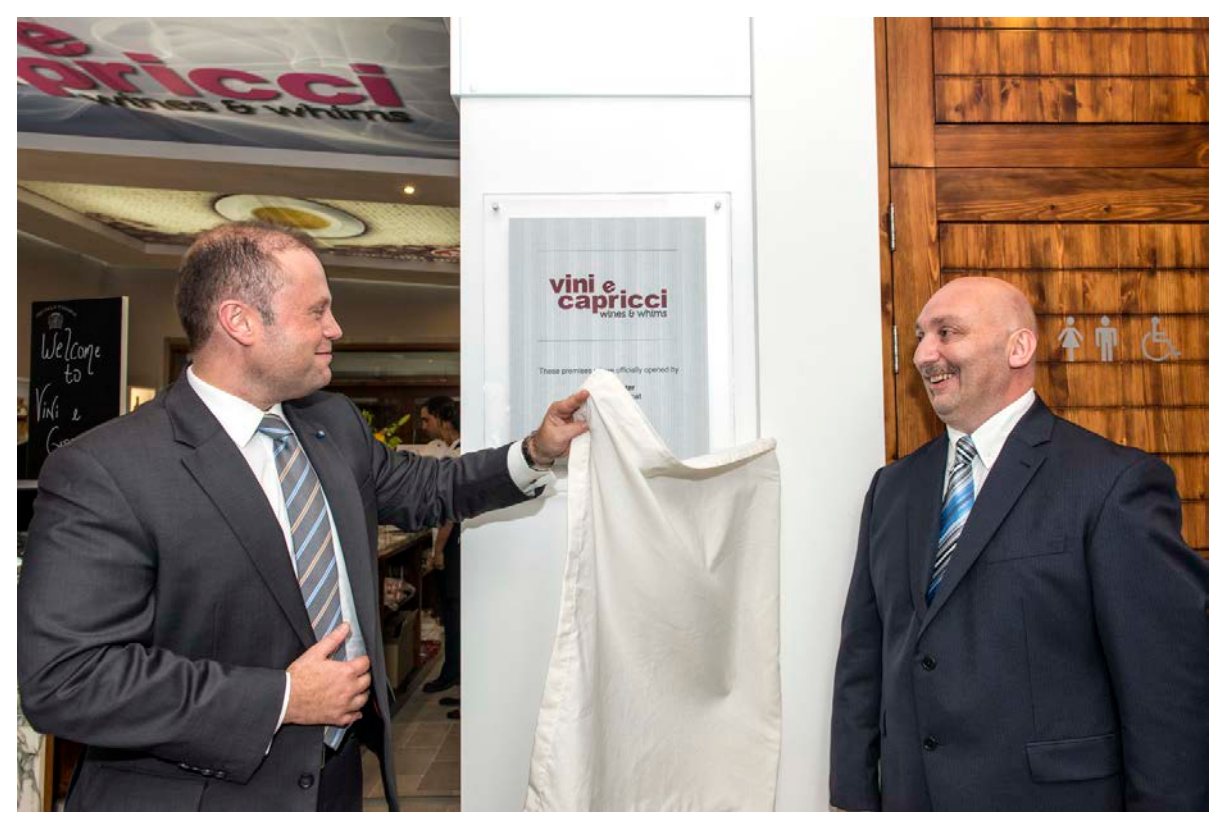
Prime Minister Joseph Muscat unveils a plaque at the grand opening of Vini e Capricci with Abraham Said looking on