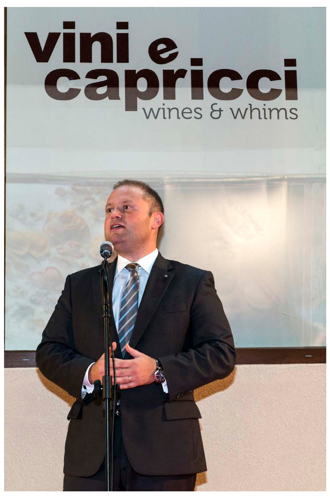
Prime Minister Joseph Muscat speaks at the opening of Vini e Capricci