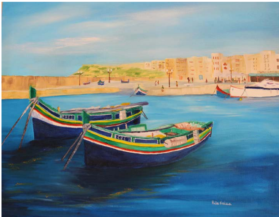
Dghajjes in Marsalforn